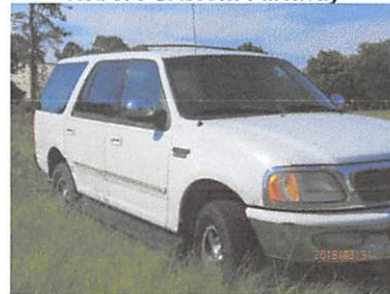
Robert Grissom Parkway