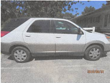
1109 Ocala Street