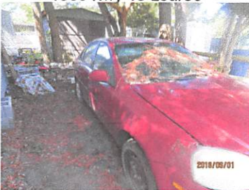
1500 Hwy 15 Lot#30